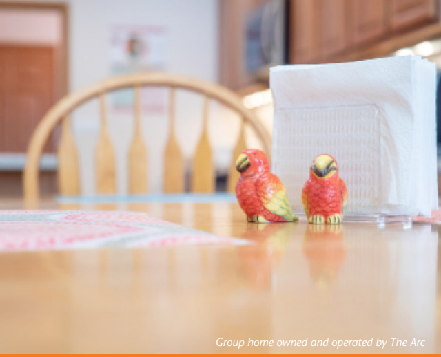
Group home owned and operated by The Arc