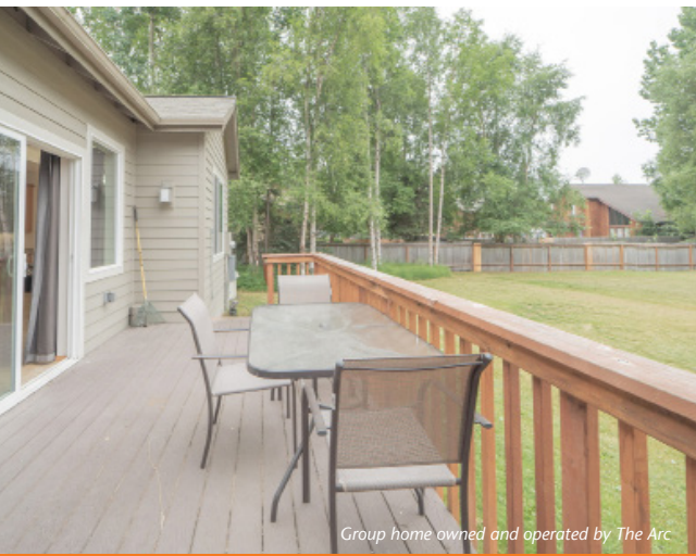
Group home owned and operated by The Arc

We believe in housing choices. Living in a safe, clean and healthy home is important to us and we strive to provide individuals with quality services and choices to enjoy life in our Alaskan community. Whether an individual lives in one of our group homes or apartments, or in their family's home, The Arc is there to support every individual in their goals and dreams. For adults, this may be independence. For children, this might mean a match with a loving foster family or specialized care for medical needs. We encourage you to contact us today about your loved one's housing needs.